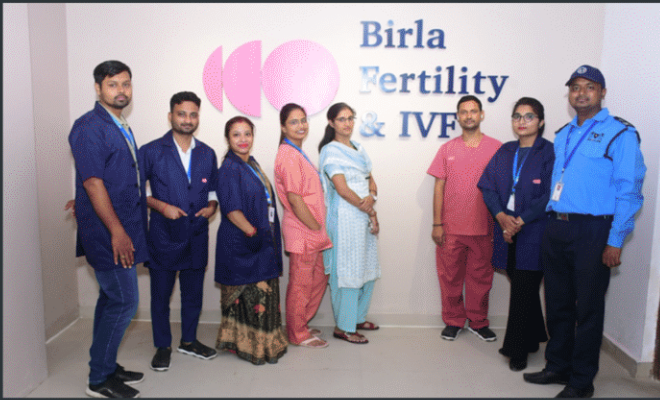
Birla Fertility And IVF Centre, Prayraj, UP