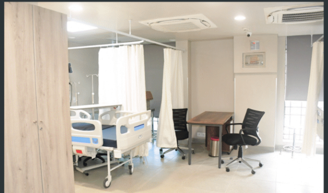
Vijaya Diagnostic Centre Limited, Hyderabad, Telangana